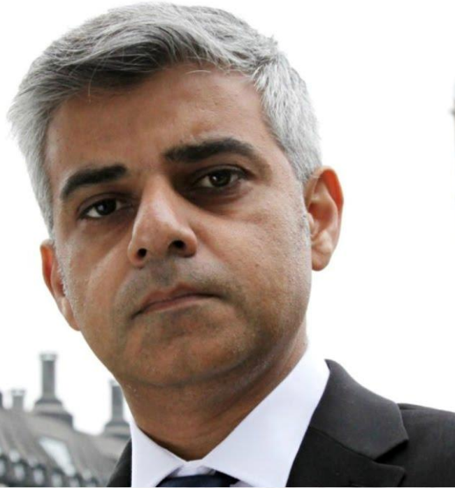
SADIQ KHAN - LONDON MAYOR

TERRORISM IS JUST PART AND PARCEL OF LIVING IN A BIG CITY.