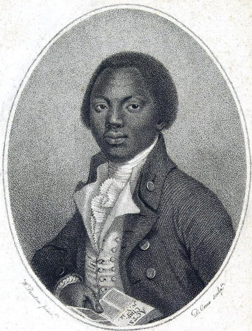
Olaudah Equiano, or GUSTAVUS VASSA, the African.

Nigeria was one of the major areas of the Atlantic slave trade, with the Bight of Benin as a major trading hub for the British, and the Bight of Biafra for the Portuguese.